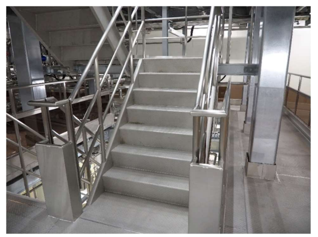
In the same factory: Stairs using POLKA PLATE \mathbin{\!\!{|}^{{}^{{}^{{}^{{}}}}}}