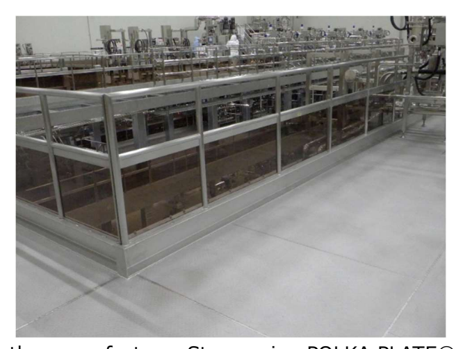
In the same factory: Stage using POLKA PLATE®