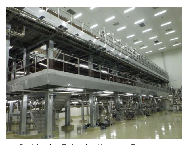
Inside the Fukuoka Kurume Factory